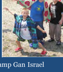
Another week of exploration and fellowship at Camp Gan Israel